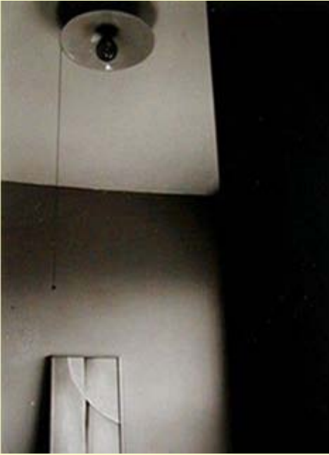
Georgia O'Keeffe Painting with Light Bulb, ca. 1936/1995

DAVID WINTON BELL GALLERY LIST ART CENTER • BROWN UNIVERSITY • 64 COLLEGE STREET • PROVIDENCE, RI 02912