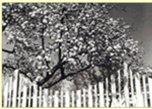
Apple Blossoms, Woodstock, 1936