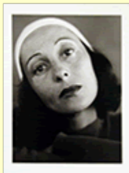
Luise Rainer, Woods Hole, 1945/1995