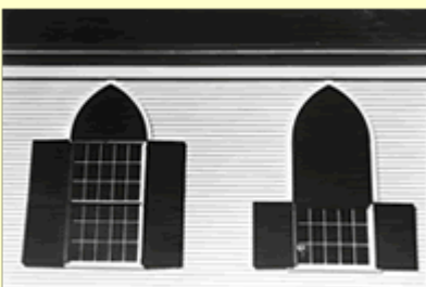
Church, Waquoit, 1953