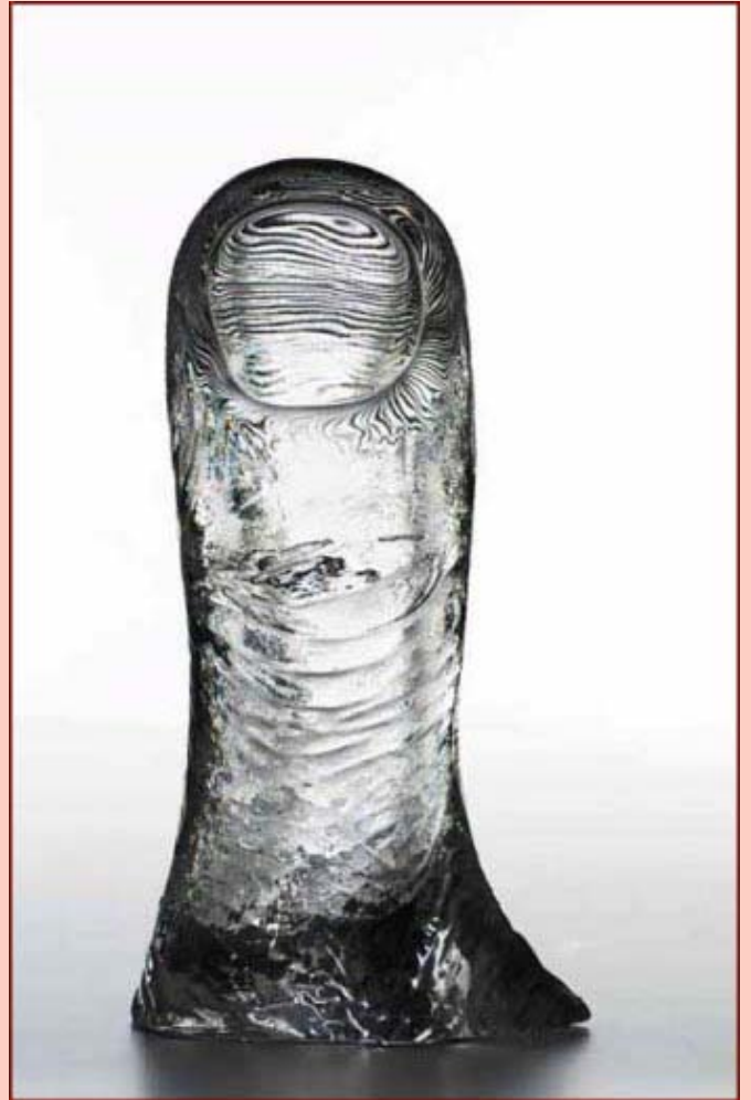
The crystal version (1989) of César's 'the thumb' (Le Pouce).

To thumb your nose is the insult gross. It is often used when at a loss. For words four letters so oft abused. That only silent signs are used. You stubby digit by Jack Horner famed. And almost omnipoetic named.